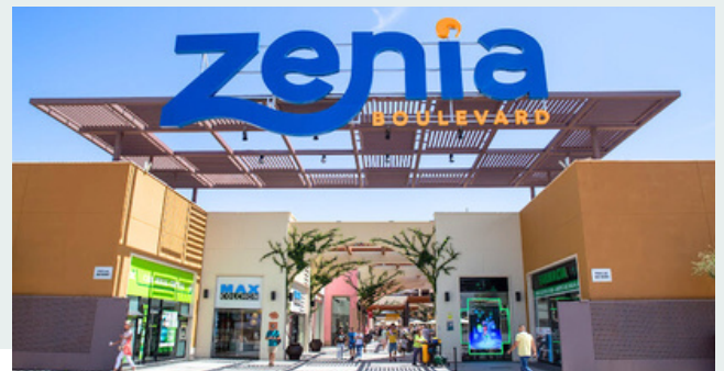
La Zenia Boulevard

We provide a full bus schedule in our welcome pack.