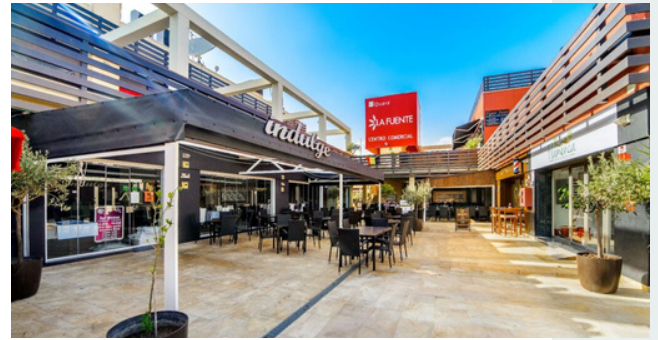
La Fuente Centre

La Zenia Boulevard is another bustling hub of entertainment and shopping.