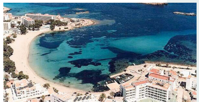
Several Blue Flag Beaches

Email paulb@pabaccounting.co.uk for info.